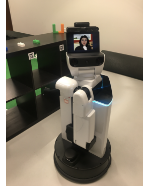
Fig. 2: eEVA running on Toyota HSR

Motion Planner: The motion planner node uses the MoveIt! library and the OMPL 8 library through MoveIt! to generate motions. The motions are requested by the eEVAHandler which handles the communication between both frameworks. The eEVAHandler processes the request from eEVA and decides which gesture to generate based on the input of eEVA. This results in the robot generating motions of the physical robot through ROS. In fig. 2, eEVA is running on HSR, and fig. 1(b) shows how eEVA is presented on Toyota HSR. All the relevant HSR components are listed in table 2. The actuators shown in table 2 are used in parallel to generate the motions discussed in sec. 4.